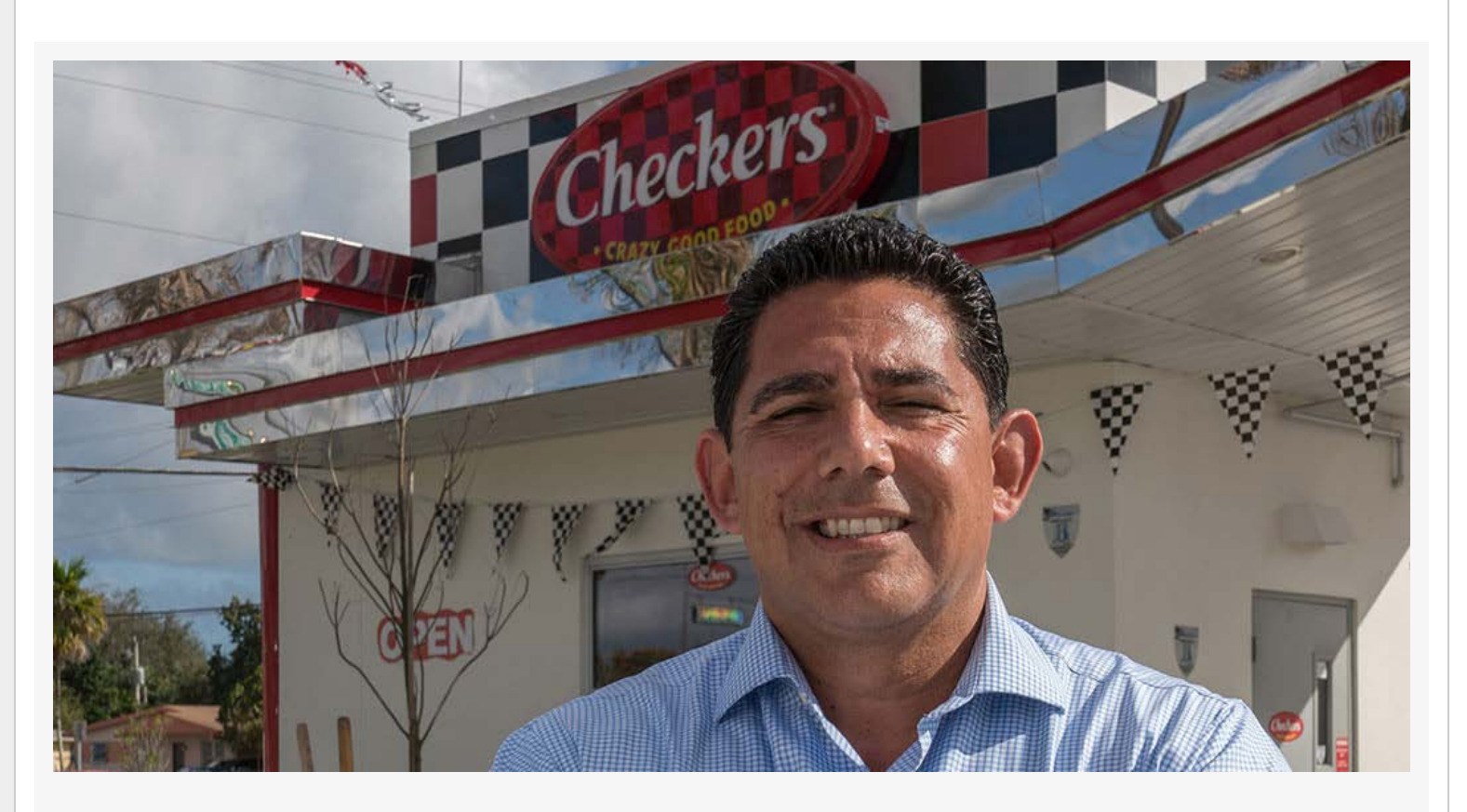
Checkers Record Growth the Result of Systems and Franchisees