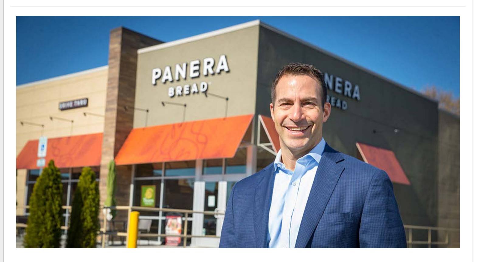
Family Man: A Way of Life, Not Just a Way of Business

Have you ever been asked what you do for a living? Rhetorical question, yes, but one that is often asked in social gatherings, and even from customers and vendors who may not truly understand what you do.